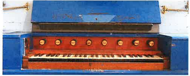
Organ at St Mary's Church, Throleigh, UK. Shared via Creative Commons Attribution-Share Alike 4.0

Deadline for submissions is the 20 th of each month for the next month's edition. All submissions must be sent to the editor at bombarde@kicago.com . No other email addresses, please.