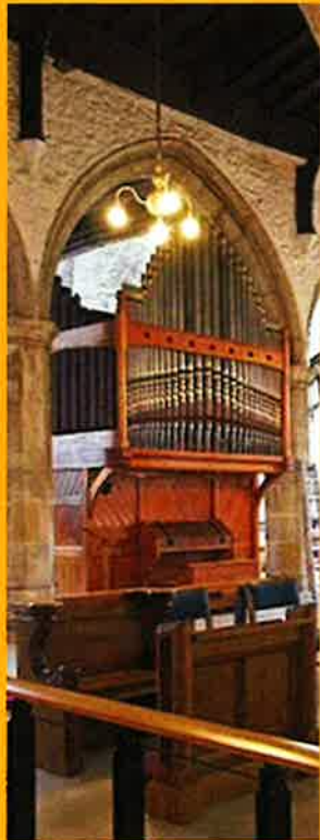
Organ at Holy Trinity Church, Kendal, UK.