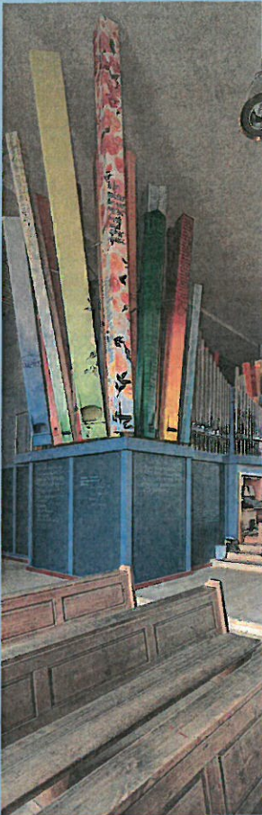
Organ of St. Elizabeth Lechhausen Parish, Augsburg, Germany.