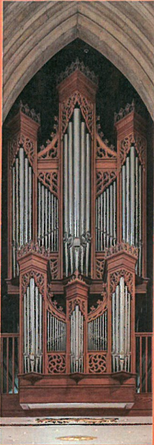
Chelmsford Cathedral Organ. Photo shared via Wikimedia Commons. Creative Commons Attribution-Share Alike 3.0 unported license.