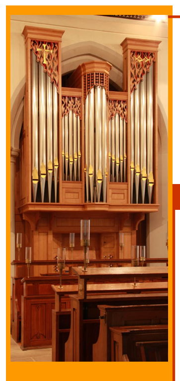
Kenneth Tickell Organ (2003) St Laurence, Upminster. London Borough of Havering.