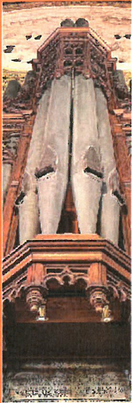
Town Hall Organ, Rochdale, England Photo: daniel via Wikimedia Project. Creative Commons Attribution-Share Alike. 4.0 International license