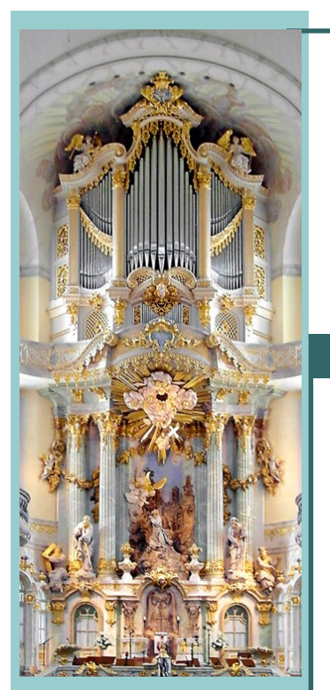
Dresden, Frauenkirche.