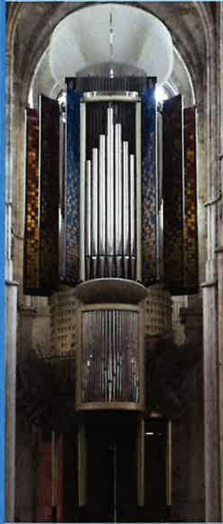
Organ at the Cathédrale Notre-Dame d'Evreux (Normandie), France.