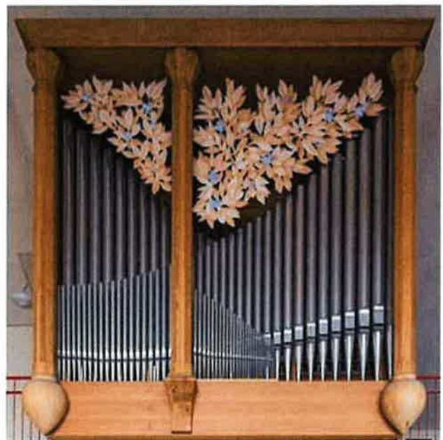
Organ loft of St. Maria Königin, Cologne, Germany.