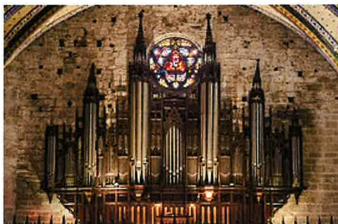
Organ of the Cathedral of Mirepoix, France. Shared via Creative Commons Attribution-Share Alike 3.0 Unported license.