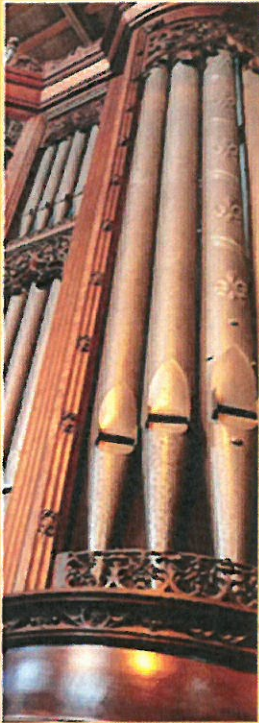
Detail of organ case, St George's Church, Heaviley, UK.