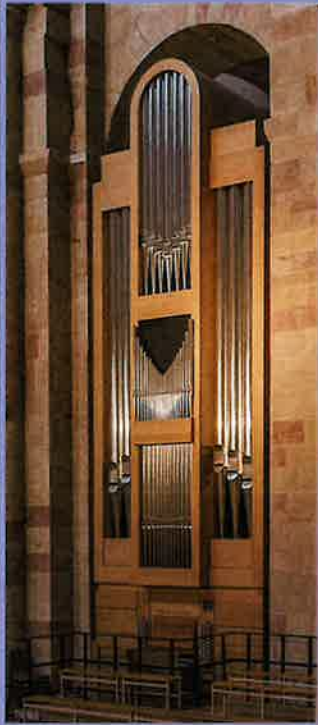
Königschor organ (2008) at Speyer Cathedral, Germany. Photographer: Friedrich Haag. Shared via Creative Commons Attribution 4.0 International license.