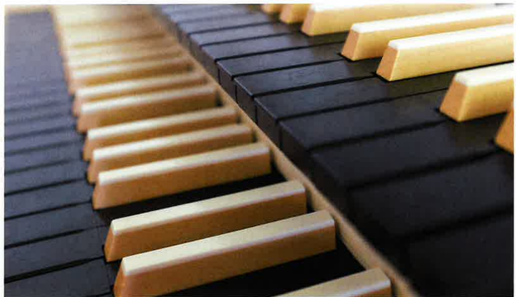
Organ Keyboards.