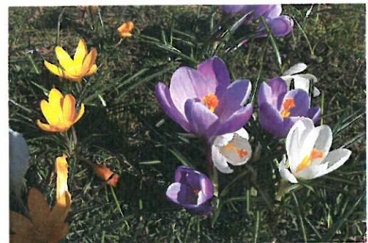
Crocus.

6:00 PM Chapter Potluck Liberty Christian Church, Liberty, MO