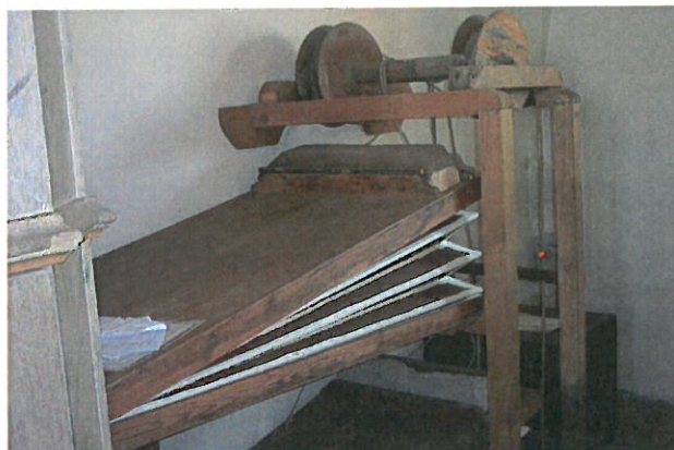
Organ bellows, Santa Maria dei Sabbioni, Rovigo, Italy.