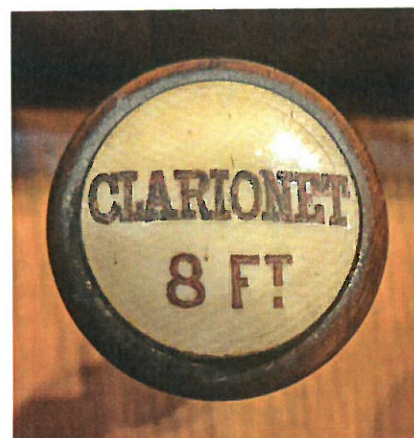
Organ Stop, Todmorden Unitarian Church, West Yorkshire.