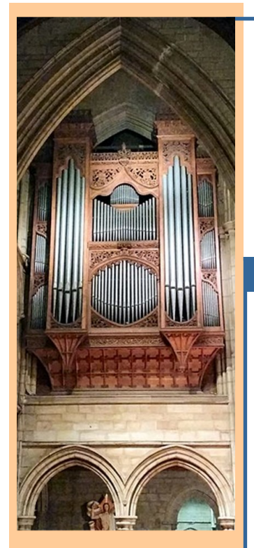
All Saints Church, Hove, UK.