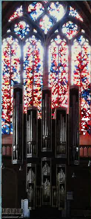
St. Victor's Cathedral, Xanten, Germany