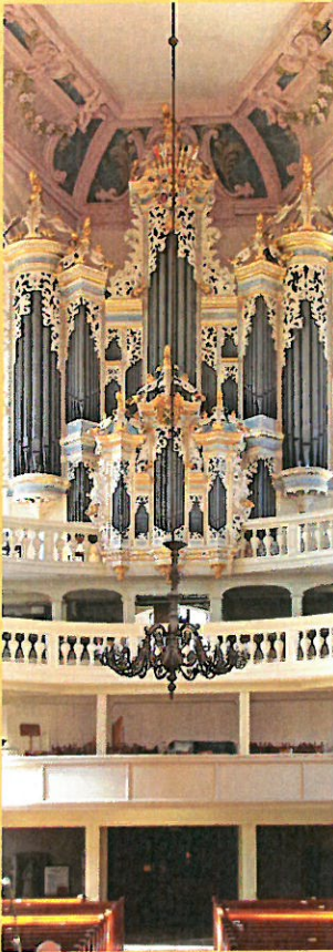
Zacharias Hildebrandt Organ (1746) Stadtkirche St. Wenzel, Naumburg