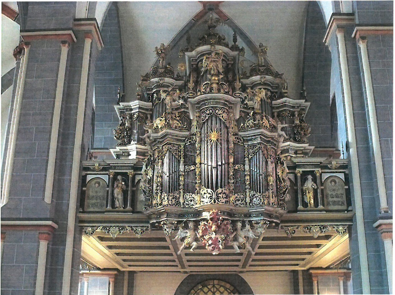
St.. Martini Church, Braunschweig, Germany. Organ completely reconstructed after WWII. Photograph courtesy of Vanellus Foto. Shared via GNU Free Documentation License, Version 1.2 or any later version.