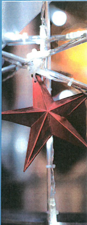
Red Star: Photograph by Jason Leung@ninjason via Unsplash