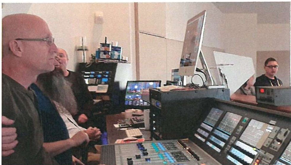
A portion of the sound and video console at Blue Valley Baptist Church. The live streaming equipment has its own room!