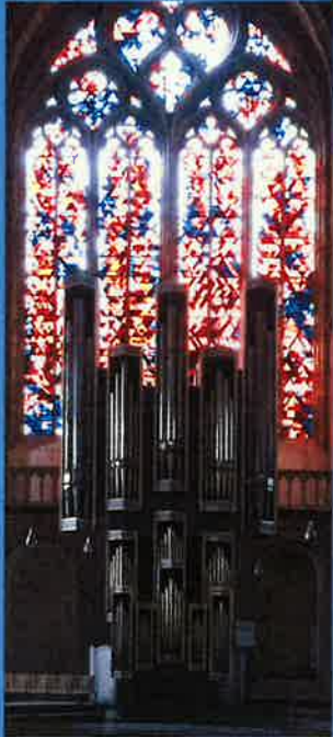
Organ at St. Victor's Cathedral, Xanten, Germany. Photographer: Ad Meskers. © Ad Meskers / Wikimedia Commons Creative Commons Attribution-Share Alike 4.0 International