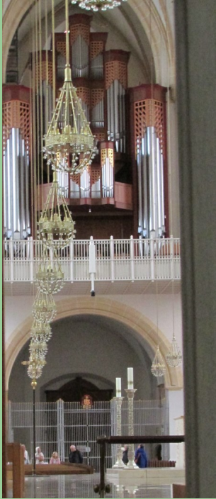
Organ of Frauenkirche, Munich. Photographer: Chris Light. Shared via CCA-SA 4.0 International license. Image in Public Domain.